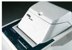
LOCKABLE COVER (LK)

It can shred automatically 170 sheets, whilst the operator can shred paper in the main throat and CDs/DVDs/Credit through the dedicated cutting unit, at the same time.