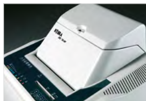
LOCKABLE COVER (LK)

It can shred automatically 170 sheets, whilst the operator can shred paper in the main throat and CDs/DVDs/Credit through the dedicated cutting unit, at the same time.