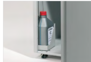
AUTOMATIC OILING SYSTEM

The lockable cover protects top-secrets or confidential documents waiting to be shredded when the shredder is left unattended. It is supplied with high security non-duplicable key.